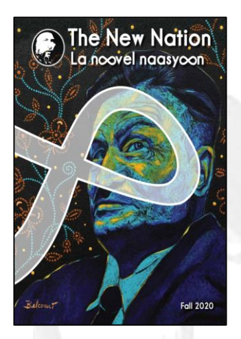
Front Cover of the New Nation: la novel naasyoon. Art by Christi Belcourt