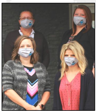
DTI Staff.